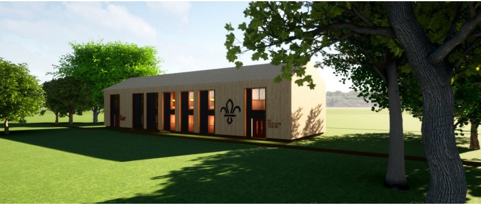
An artist's impression of the new accommodation block at Waddecarr.

After significant work and discussion, the Board of Trustees have begun the process of making this happen. We have committed a significant amount of our funds to start this project and will be working with the contacts we made through our external relations work to move this project to a reality. There will be an opportunity for everyone to be involved in a fundraising scheme which will be shared very soon.